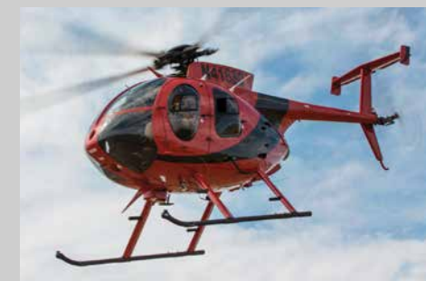
Kurdistan Regional Government Police