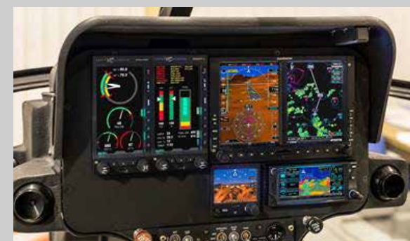
Glass Cockpit with Howell Industries Engine Instrument Display