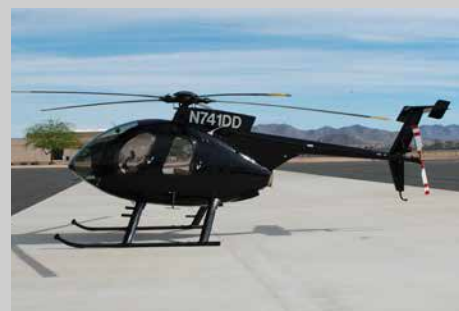
Verde Canyon Railroad, LLC