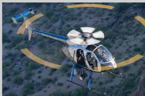
Mesa (AZ) Police Department