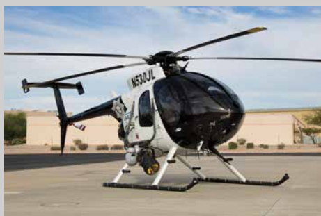
Las Vegas (NV) Police Department