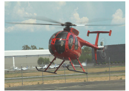
Corporate Helicopter's new MD 530F

"As a customer, I am truly amazed at the