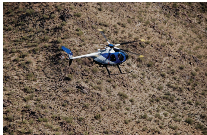
San Diego Sheriff's Department makes daring rescue in an MD 530F

"Once again, Bligh backed the MD 530F away from the rock face and used the mountain terrain to guide his way through the smoke and to the safety of El Monte Park and solid ground."