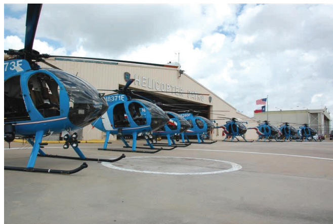
Part of the Houston PD's fleet of 10 MD 500E Helicopters.

"Because the division's goal is to keep at least one helicopter in the air for almost the whole of each day, most flights start out as routine patrols. Air support crews are called to assist with vehicle pursuits, the apprehension of suspects, responses to crimes in progress and more... The division is also called upon for special operations photo flights, dignitary protection, and limited search and rescue duties. "The MD 500's speed and maneuverability is an advantage in covering Houston's large geographic area, and in responding quickly to multiple calls."