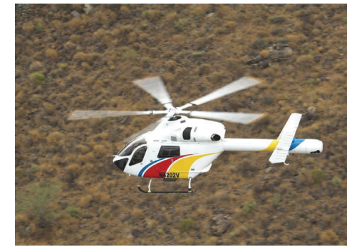
Huaxi Village Group's New MD Explorer

Equipped with the 650 shp Rolls Royce 250-C30 engine and longer main-rotor blades, the MD 530F is the company's finest high-altitude, hot-day performer. When compared to the MD 500E, the 530F's tailboom is extended eight inches, and the tail rotor blades are also extended to provide increased thrust and directional control at high altitudes.