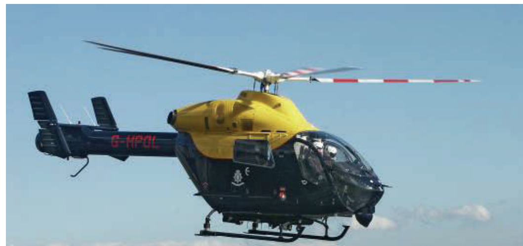
Milestone - The Humboldt Police Authority has announced that its MD Explorer has reached 10,000 hours service. The helicopter is now the second to have achieved the 10,000 hour milestone.